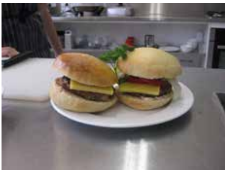
Beginners Class B Line for Year 7 Year 7 Hamburgers ready to go