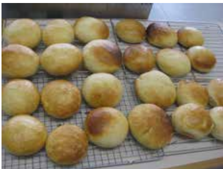
Bread rolls made by Baking for