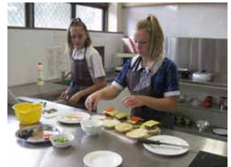
Year 7 production line for ham-burgers