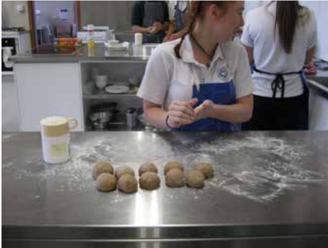
Yeast Buns made by Baking for Beginners Class - B Line.