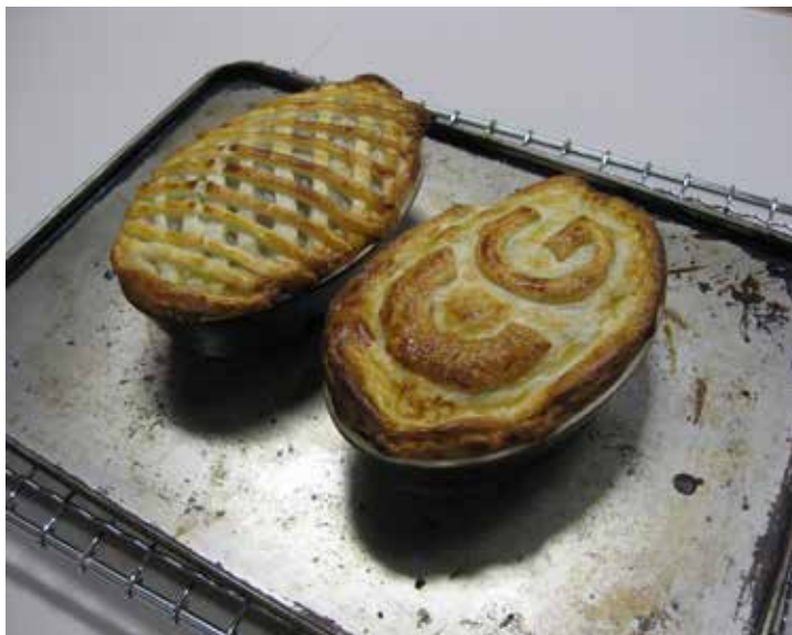
Delicious 'Lucy's Meat Pie' made by student in GLine Baking for Beginners T1 Wk6