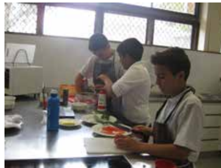
Year 7 organising ingredients for their hamburger