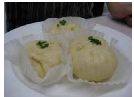
Steamed Pork or Chicken Buns by Year 7 & Year 8 Food Studies classes