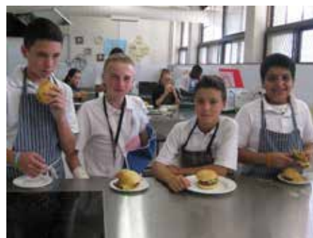
Year 7 students eating their ham-burger creations - looks delicious