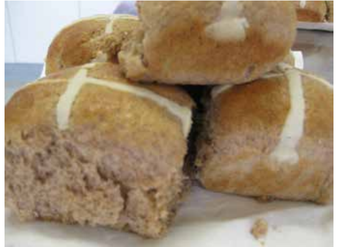
Yeast Buns - the aroma lingers throughout our corridors.