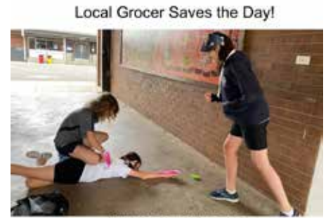
Local Grocer Saves the Day!